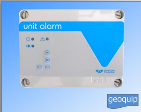
Unit Alarm Control Panel