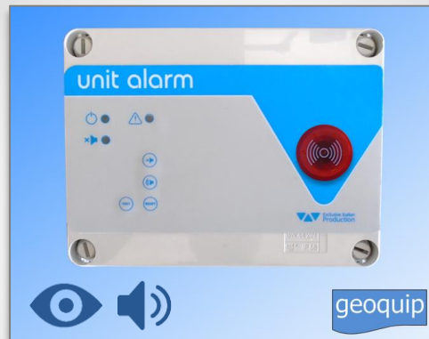
Control Panel with Audio & Visual