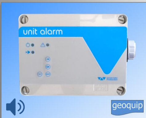
Control Panel with Audio