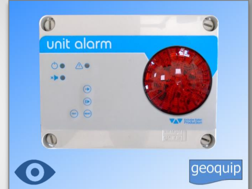
Control Panel with Visual 50mm Beacon