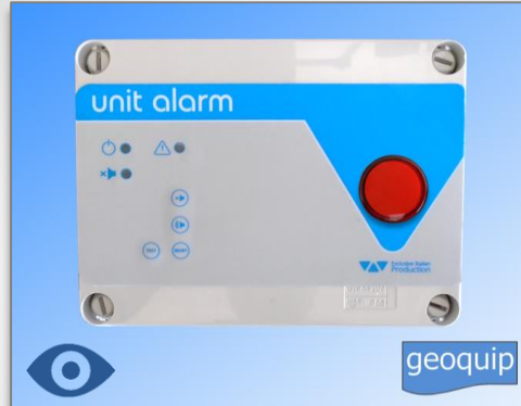
Control Panel with Visual Beacon